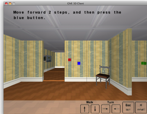
Figure 1: The GIVE Challenge.

GIVE (“Generating Instructions in Virtual Environments”) (Koller et al., 2007) is a research challenge for the NLG community designed to provide a new approach to NLG system evaluation. In the GIVE scenario, users try to solve a treasure hunt in a virtual 3D world that they have not seen before. The computer has a complete symbolic representation of the virtual environment. The challenge for the NLG system is to generate, in real time, natural-language instructions that will guide the users to the successful completion of their task (see Fig. 1). One crucial advantage of this generation task is that the NLG system and the user can be physically separated. This makes it possible to carry out a task-based evaluation over the Internet – an approach that has been shown to provide generous amounts