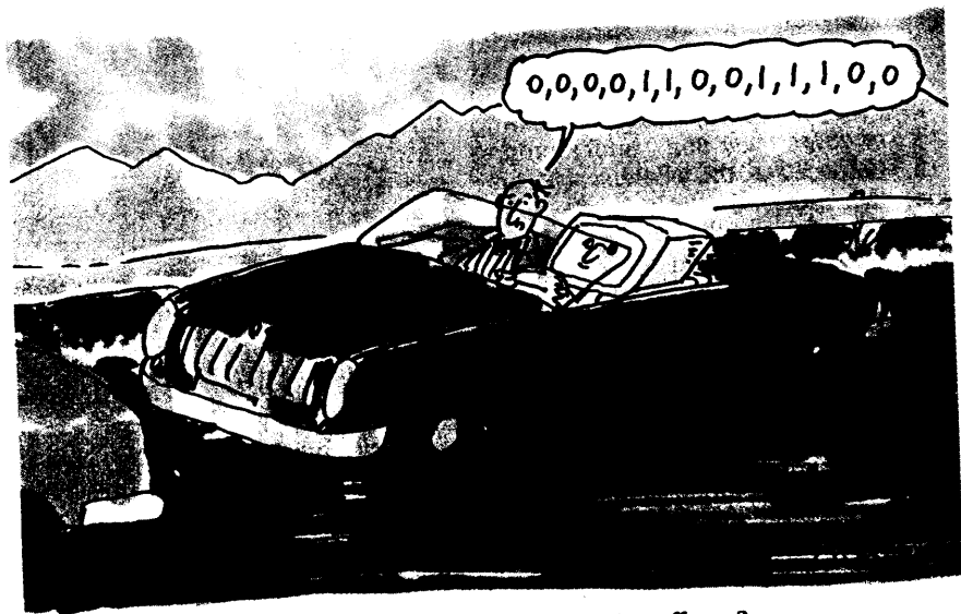
Which semantics is the system giving off now?

d. Semantics doesn't exist anyway; there is only syntax. It is a kind of prescientific illusion to suppose that there exist in the brain some mysterious “mental contents,” “thought processes” or “semantics.” All that exists in the brain is the same sort of syntactic symbol manipulation that