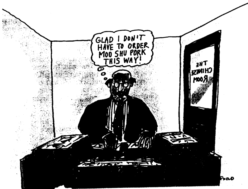
I satisfy the Turing test for understanding Chinese

Fourth, I have tried to refute strong AI so defined. I have tried to demonstrate that the program by itself is not constitutive of thinking because the program is purely a matter of formal symbol manipulation—and we know independently that symbol manipulations by themselves are not sufficient to guarantee the presence of mean-